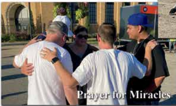
Prayer for Miracles