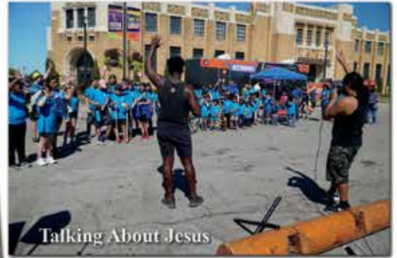
Talking About Jesus