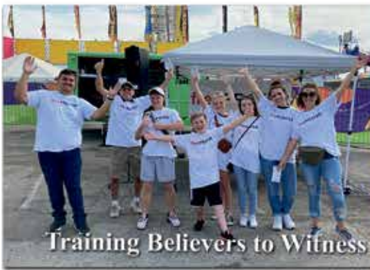
Training Believers to Witness