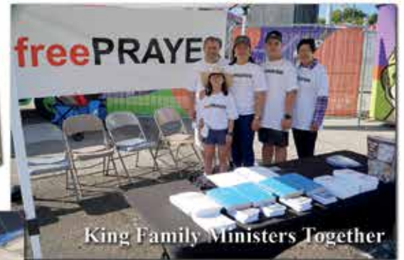
King Family Ministers Together