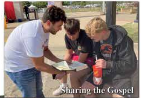
Sharing the Gospel