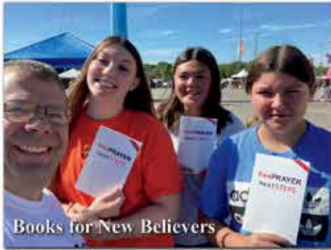
Books for New Believers